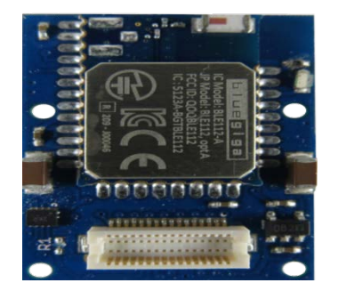
Fig 6: Tiny shield bluetooth low energy B. Mobile apps

The bluetooth low energy (BLE-Version 4) acts as an interface for android or ios devices which operate on low power sensors on high voltage with bluegiga BLE 112 module for a wireless communication of 10 meters with a power supply of 3-5V.