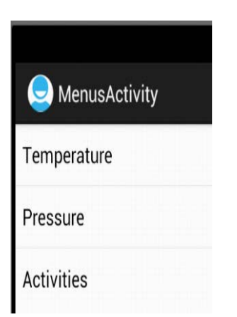
Fig 8:The measured observations are transmitted to the respective page to generate report