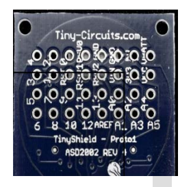
Fig 4: Tinyshield protoboard with spacing 0.1"

Protoboards are used to collect all the signals from the sensors and confined to single point to be transmitted to mobile apps usig interface. The signals are spaced 0.1'' with 0.1'' header which is default.