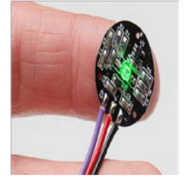
Fig 5: Front end and backend of pulse sensor

The bluetooth low energy (BLE-Version 4) acts as an interface for android or ios devices which operate on low power sensors on high voltage with bluegiga BLE 112 module for a wireless communication of 10 meters with a power supply of 3-5V.