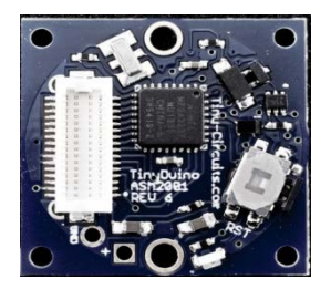
Fig 2: TinyDuino Microcontroller

The wearable device consist of tinyduino processor board consist of Atmel Atmega328P microcontroller with 14 digital input/output pins and 6 analog inputs pins with 8MHz ceramic resonator. The accelerometer tinysheild consist of inbuilt temperature sensor and pulse sensor amped which is used to measure activities, temperature and heart beat. Tiny shield protoboard 1 is used to translate the signal from tinyduino which is connected to header using mounting screws in which the pins are spaced 2mm apart. The mounting crews is used to connet the tinyduino, sensors for transmitting the signal to the respective pins. Tinyduino is powered by either using VBATT or 5V using universal serial bus( USB) tinyshield by connecting to the system.